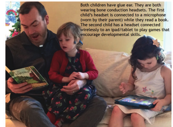
Both children have glue ear. They are both wearing bone conduction headsets. The first child's headset is connected to a microphone (worn by their parent) while they read a book. The second child has a headset connected wirelessly to an iPad/tablet to play games that encourage developmental skills.